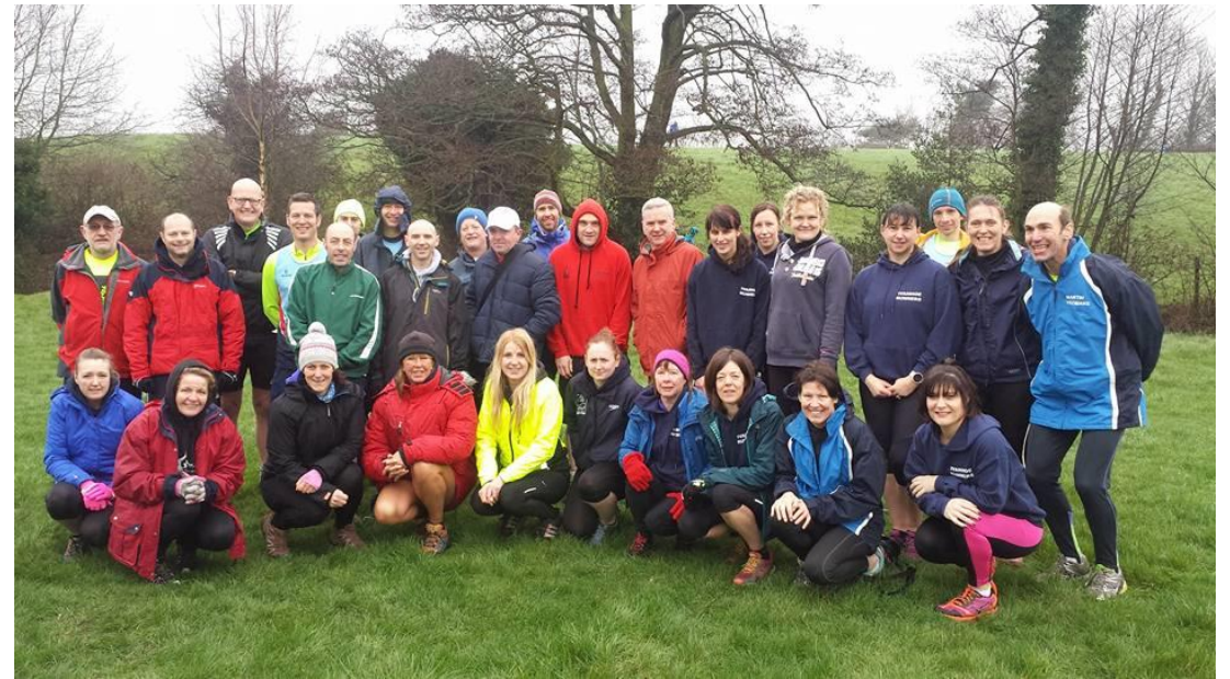
The Ivanhoe crew at Grace Dieu.....

For pictures of any of this lot, see Interpol or our website "Runners" tab.